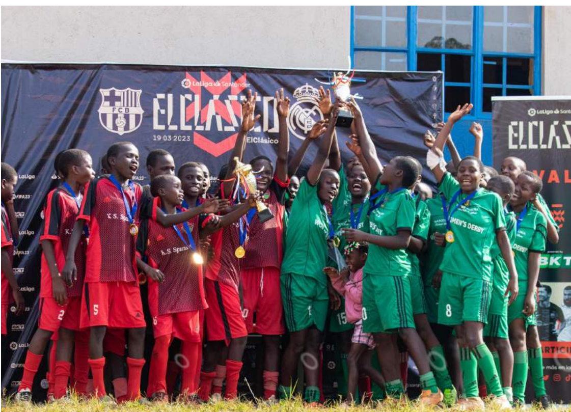
Winners: LaLiga El Clasico U15 tournament (both boys' and girls' categories)