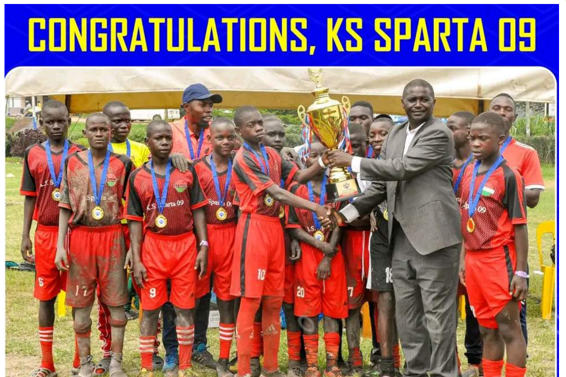
National Champions U13 At UYFA championships in Mbarara