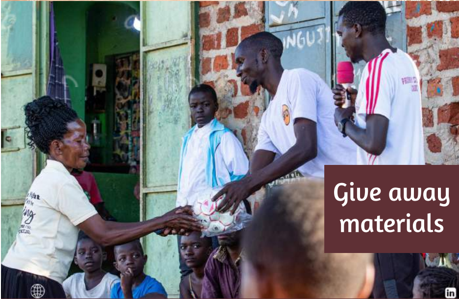
Give away materials