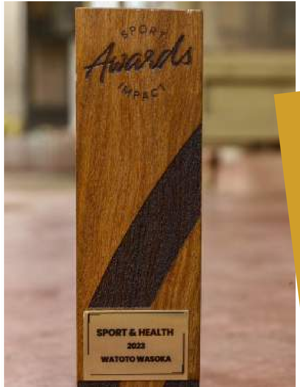
iF Social Impact Award Football 4 WASH (Winner, 2023)