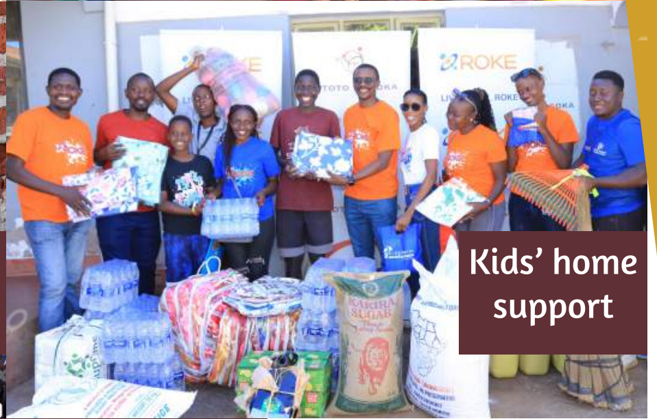
Kids' home support