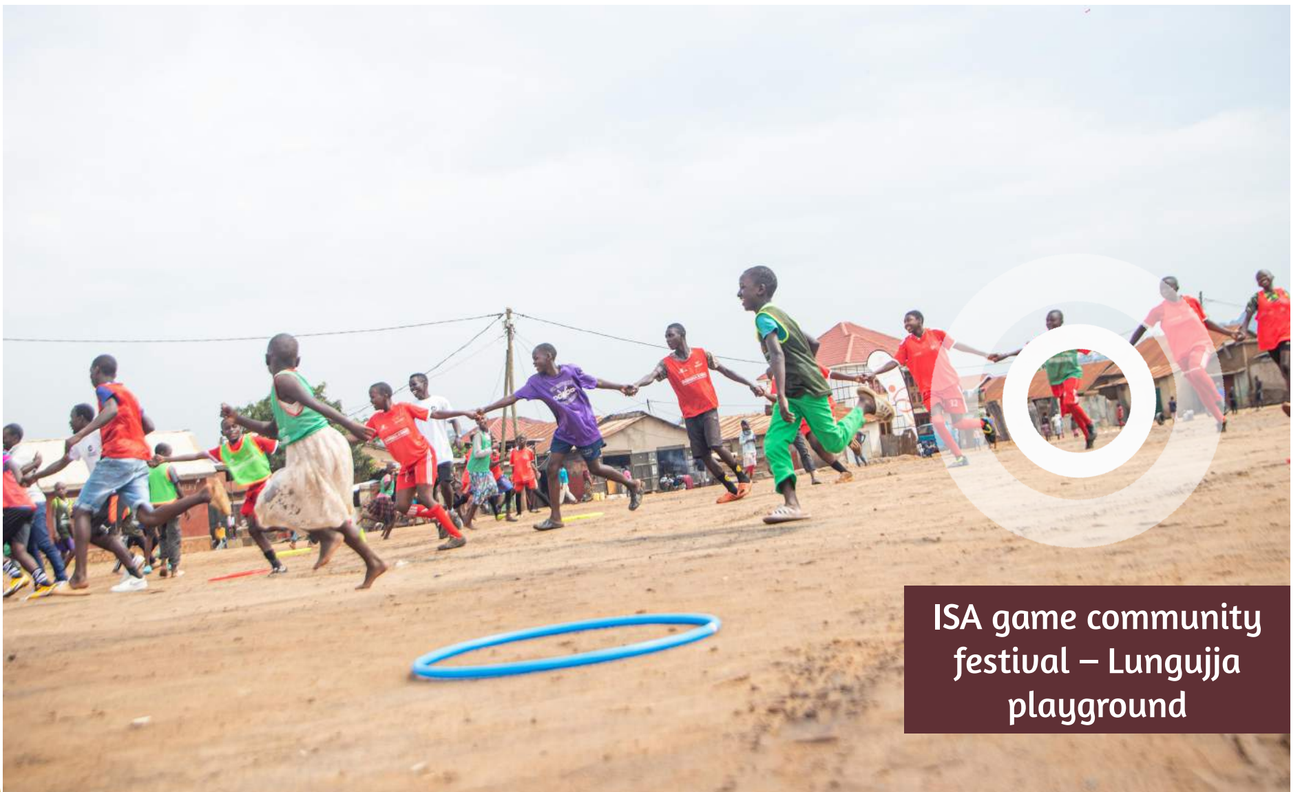
ISA game community festival – Lungujja playground