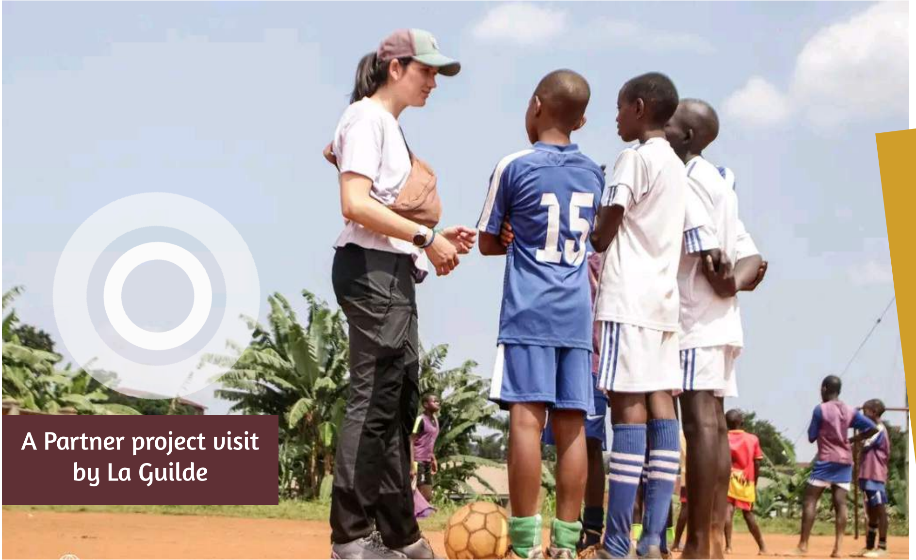
A Partner project visit by La Guilde