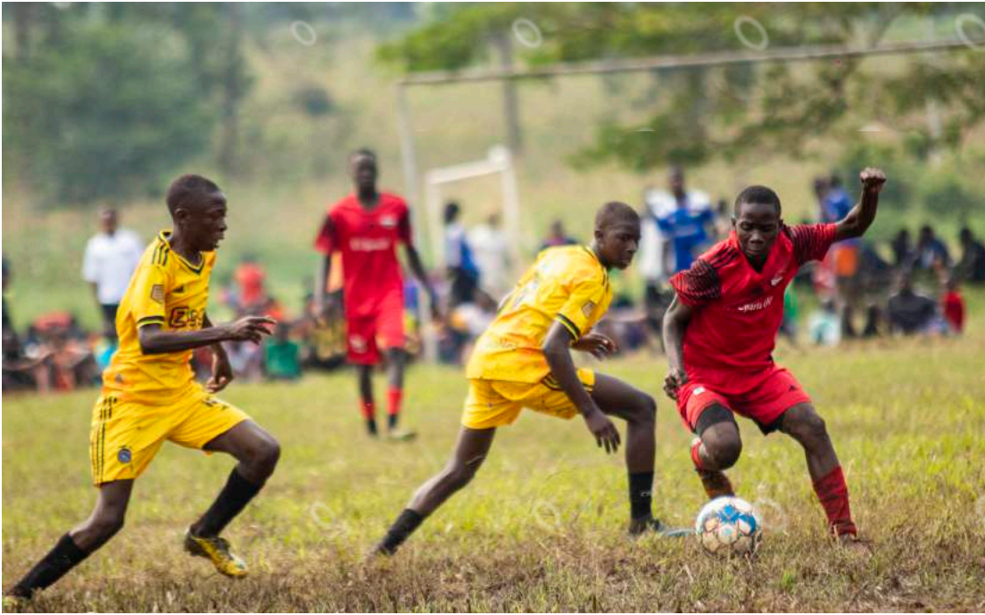
U15 Champions at Watoto Wasoka Christmas camp